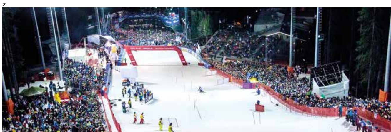
01 Madonna di Campiglio, 3Tre FIS Ski World Cup

Many sporting champions and several national and international teams have chosen the area for training in winter, too: the Norwegian Alpine Ski Team have been using the slopes of the Paganella as their training base while the US Ski Team trains in the Alpe Cimbra.