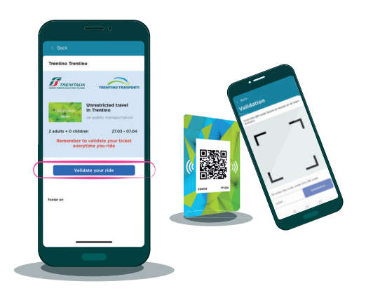
Validate your journey on buses or at train stations. Scan the QR code or enter the code (TTxxxx)